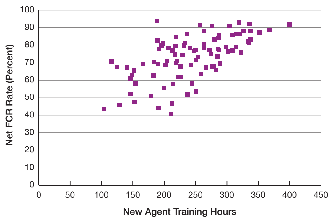
Figure 2: New Agent Training Hours vs. Net FCR